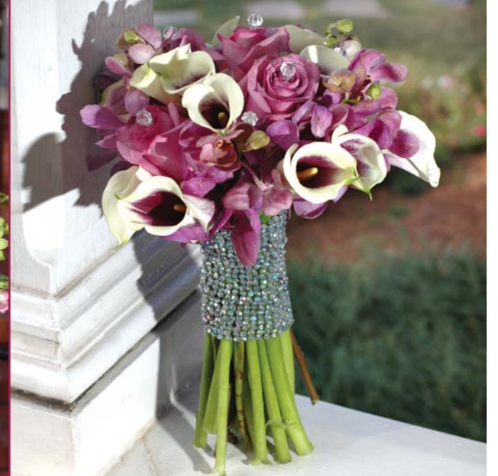
Purple and lilac are hot colors this season. Brilliant hues of purple can be found in lilies, roses, and orchids. TOP: Fleurutations BOTTOM RIGHT: Fleurutations BOTTOM LEFT: The Purple Poppy